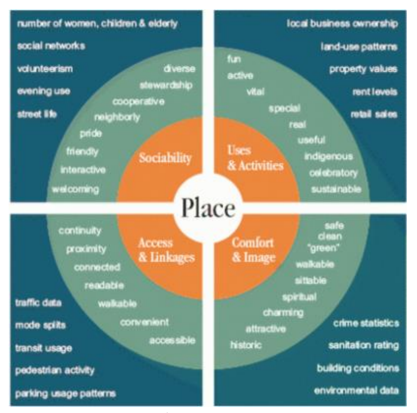
Figure 2: Components of placemaking | Graphic by Glenn Pape of MSU Land Policy Institute from a similar graphic by Project for Public Places, New York.

The most important thing about "quality place" is that each community has its own unique characteristics. Each community has its own set of assets and attributes that are genuine for that community. One should build on those unique assets to enhance and build place.